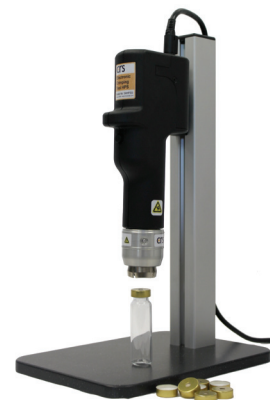
Base with Mounting Kit