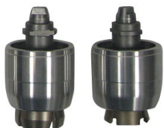
20 mm crimper and decapper jaws