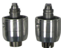
11 mm crimper and decapper jaws